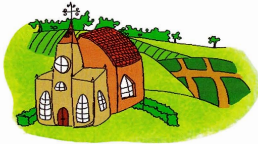
fields behind the church not near the river