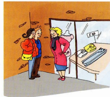
women in front of the shop not near the school