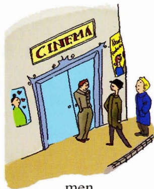
men in front of the cinema not near the shops