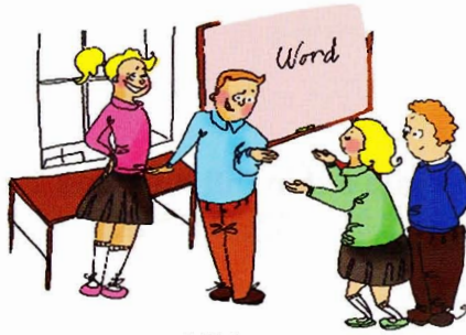
children in the classroom not in the park