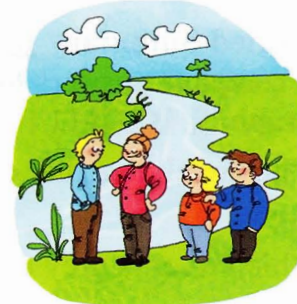
people beside the river not in the park