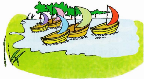
boats on the river not on the beach