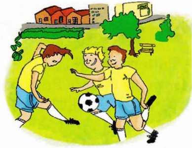
football players in the park not in the street